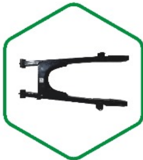
SUSPENSION U FORK REAR