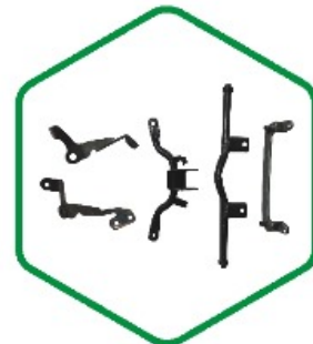
HEAD LIGHT STAY