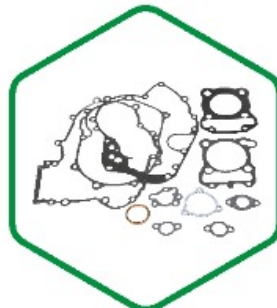
ENGINE GASKET FULL