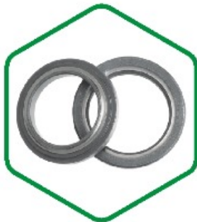
UPPER CONE SET