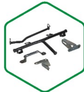
HEAD LIGHT STAY