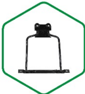
NUMBER PLATE PATTI