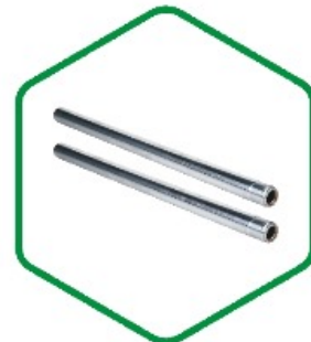
FORK MAIN TUBES