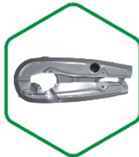
CHAIN COVER SET