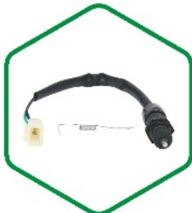
REAR BRAKE SWITCH