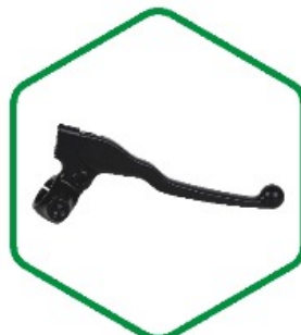
LEVER & YOKES