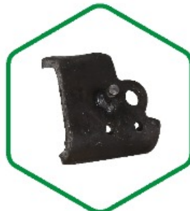
SIDE STAND BRACKET