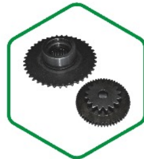
SELF GEAR BIG & SMALL