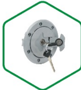
PETROL TANK LOCK