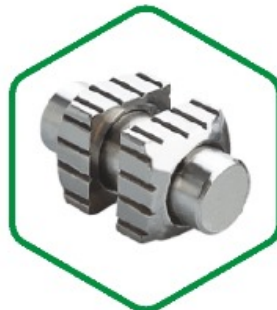
SLIDER BLOCK SET