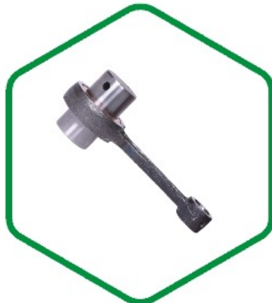
CONNECTING ROD KIT