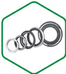
BALL RACER SET