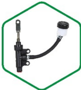
MASTER CYLINDER REAR