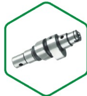
CAM SHAFT BODY