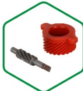
SPEEDO METER PINION