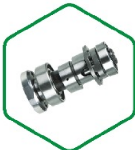
CAM SHAFT ASSEMBLY