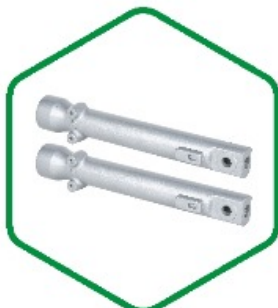
BOTTOM TUBE SETS