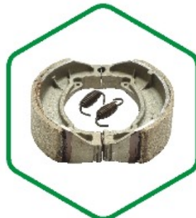
BRAKE SHOE SET