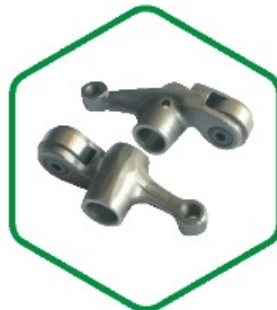
ARM ROCKER SET