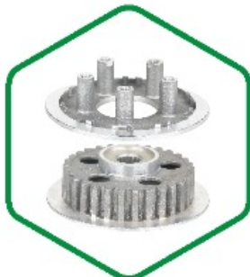
CLUTCH HUB & CENTERS