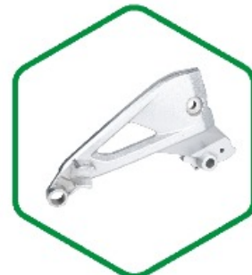
FOOTREST "V" BRACKETS